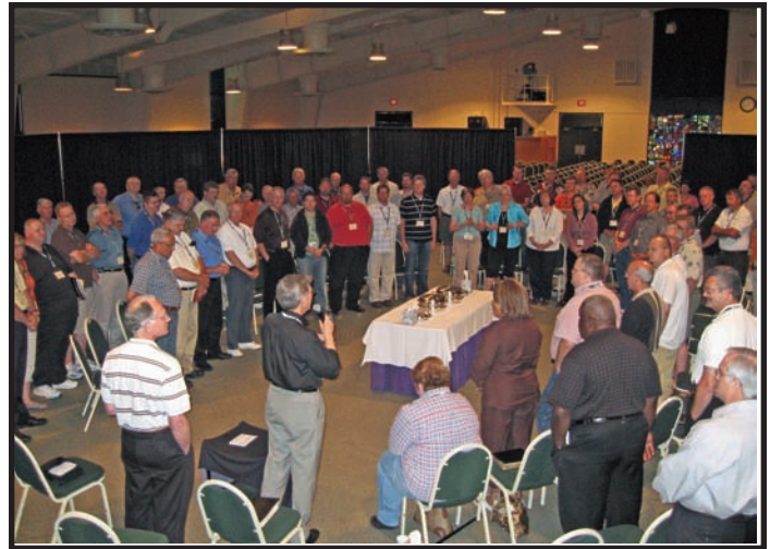
Olivet Nazarene University Prayer Summit, June 2007.

continued on page 13, Regional Prayer Summits