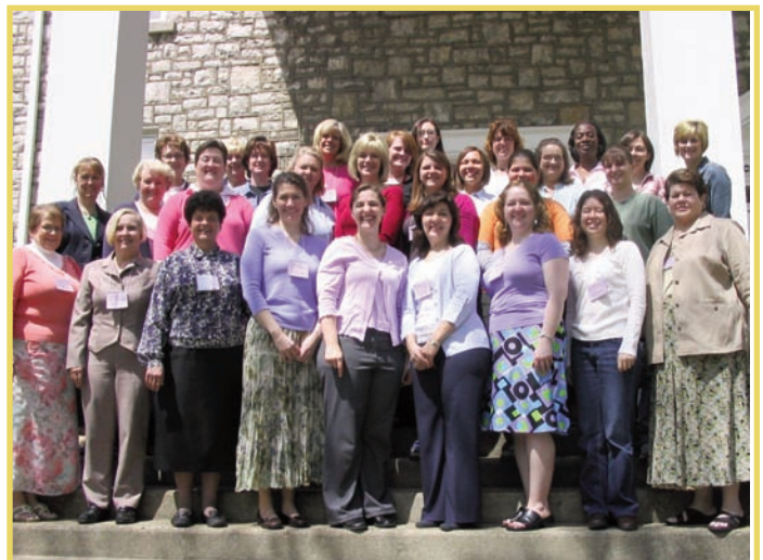
Inaugural conference of the Women in Ministry Network (WIMN) at Trevecca Nazarene University, April 2007